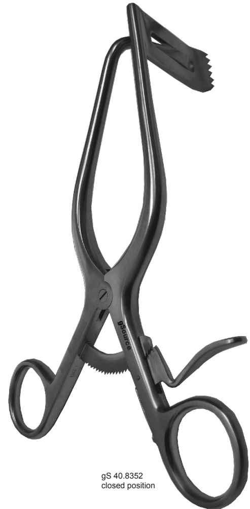
gS 40.8352 closed position